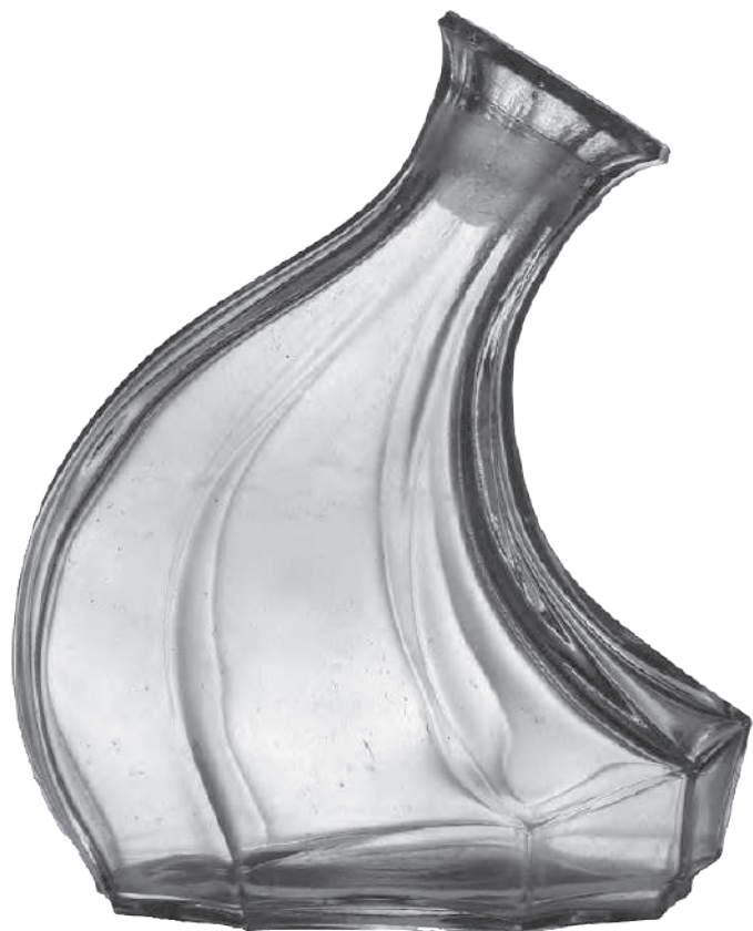
Liquor bottle for semi-automatic (kiko) or hand-blown technology (1935).