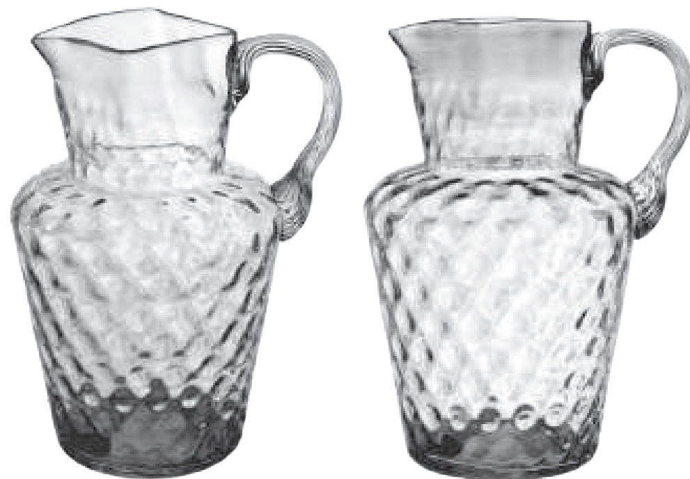
Hand blown pitcher with structure (1935 - 1960).