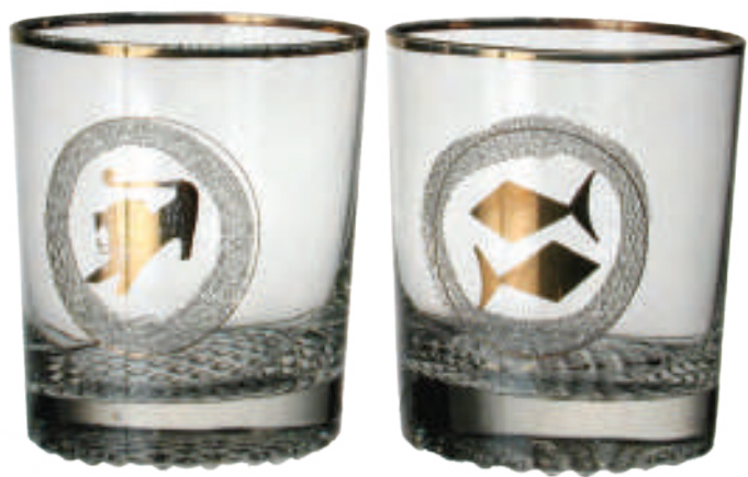
Tumbler Horoscope - hand blown, turned botton (1965).