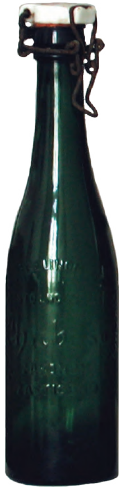
GREEN GLASS BEER BOTTLE

Green glass bottle for elder beverage semi-automatic (kiko) blown (1937).