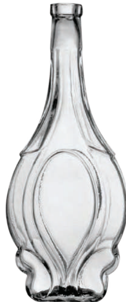
Liquor bottle for semi-automatic (kiko) or hand-blown technology (1936).