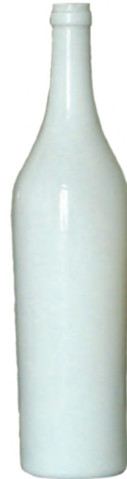
HAND BLOWN OPAL BOTTLE

Green glass bottle for elder beverage semi-automatic (kiko) blown (1937).