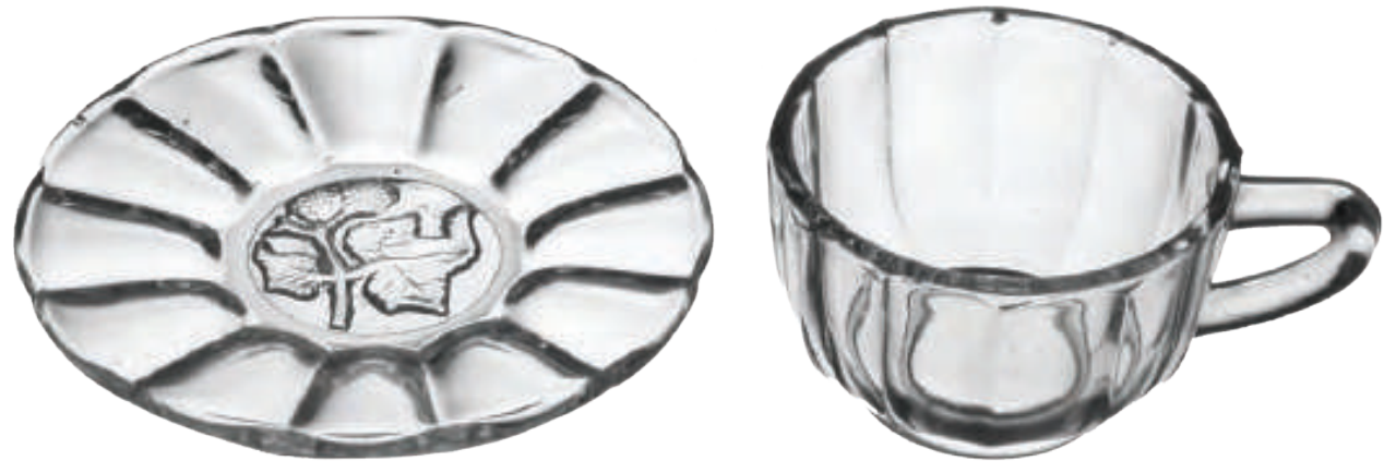
Cup with saucer (1930-45).