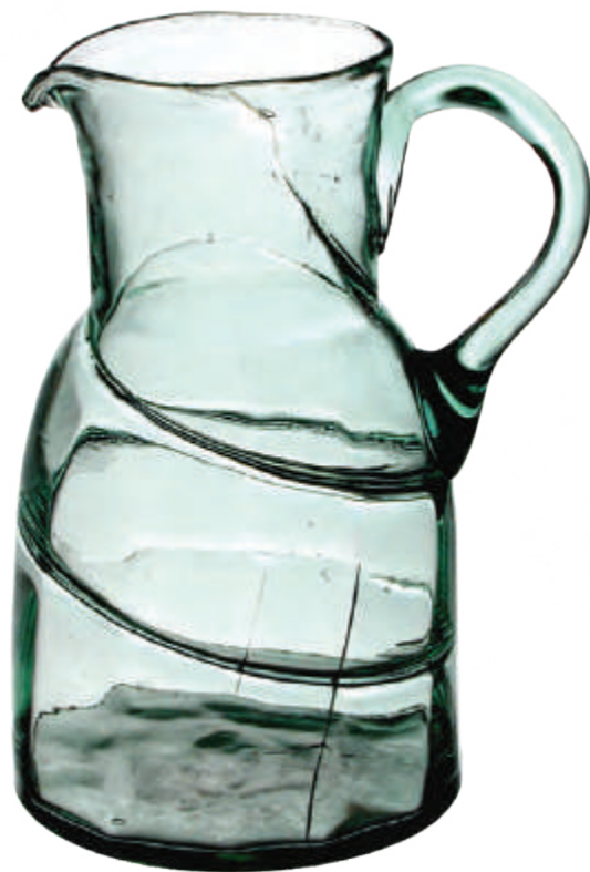
Hand-blown pitcher special winding of glass thread (1935).