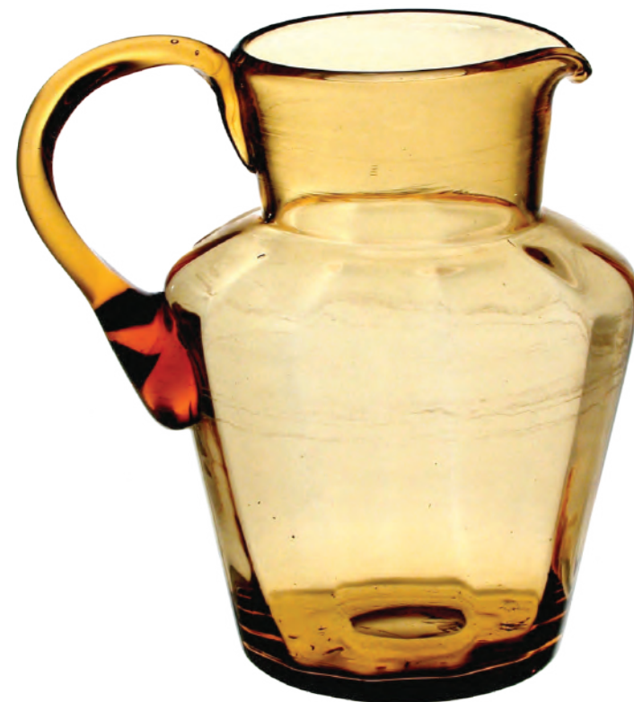
Hand-blown pitcher - colour glass with optics (1946 -1950).