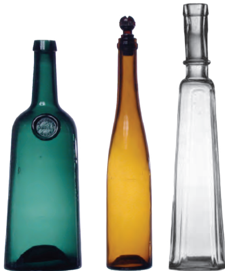
Semi-automatic pressed (KIKO) bottles - partly personalised (see the names of beverage producers). These products are dated before the second World War.