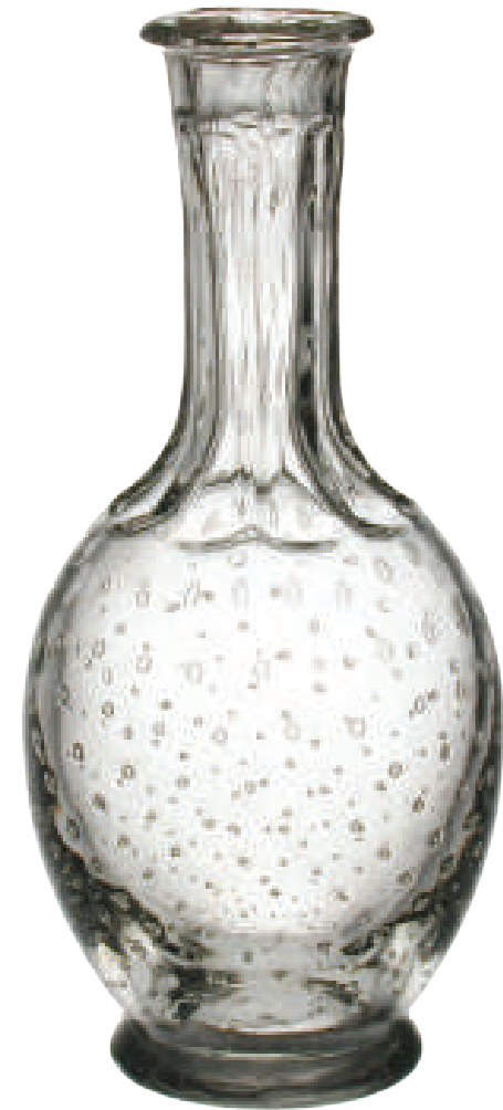
Bottle - hand blown with air bubbles (1985).