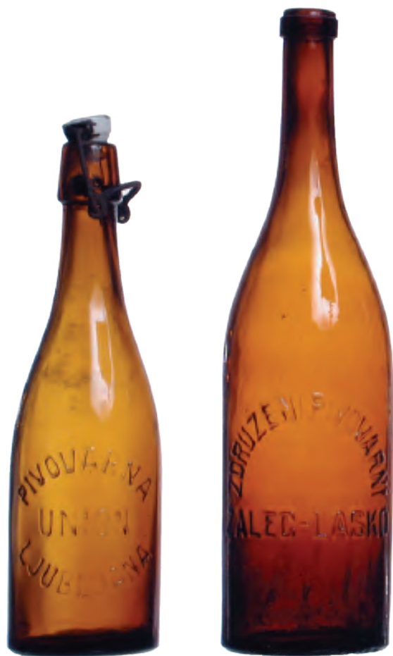
SEMI-AUTOMATIC PRESSED (KIKO) BOTTLES