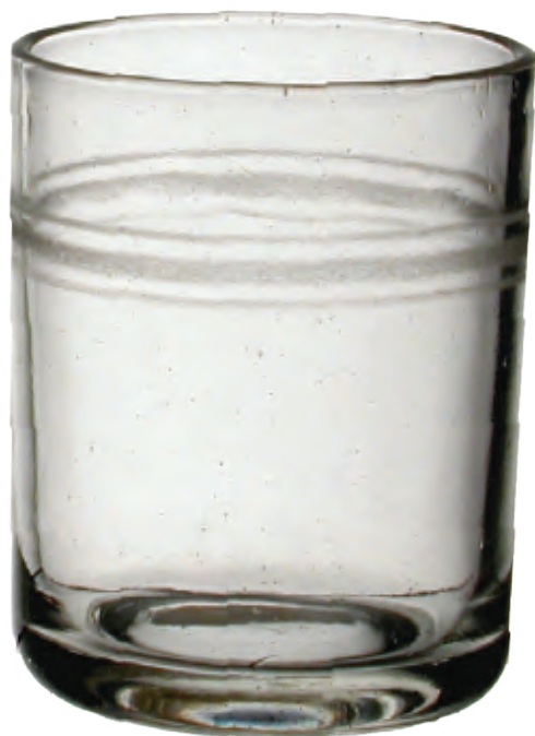
Tumbler - semi automatic pressed (1935 - 1960).