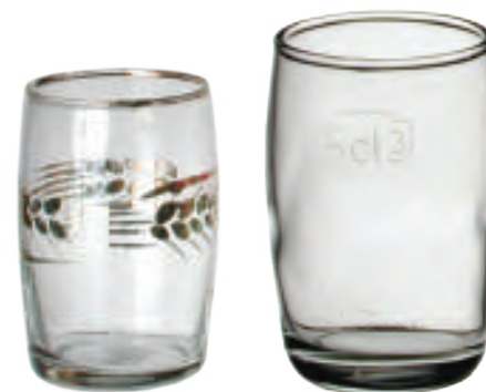
Tumbler 1039 - line H-28, automatic blown (1980).