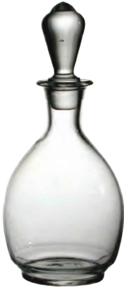
Bottle - hand blown technology (1950 - 1980).