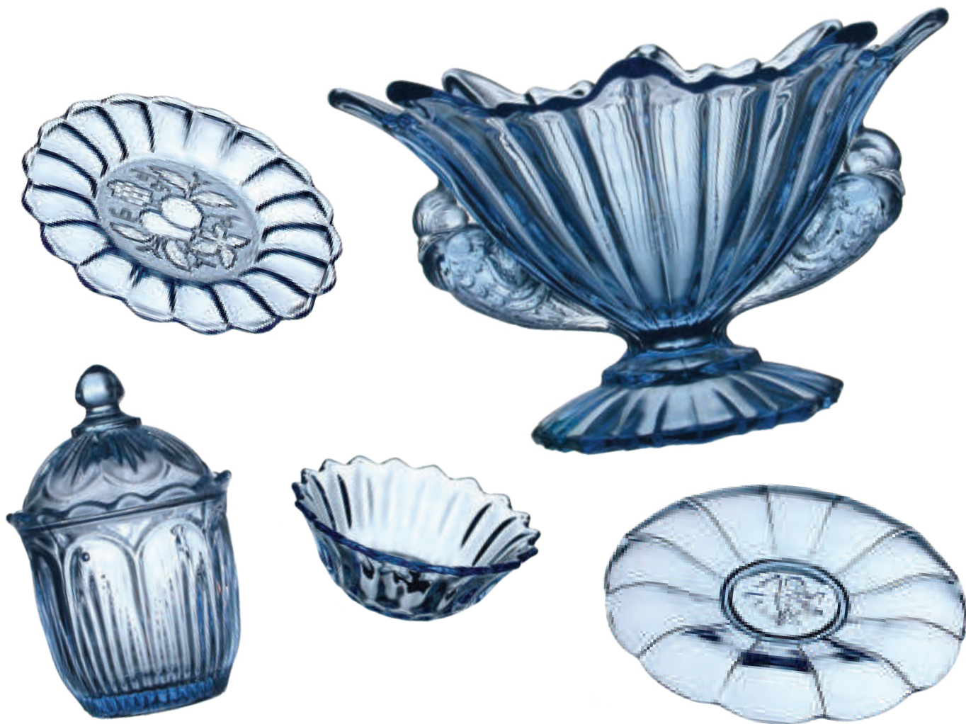
Tableware set in colour - semi-automatic press (1955).