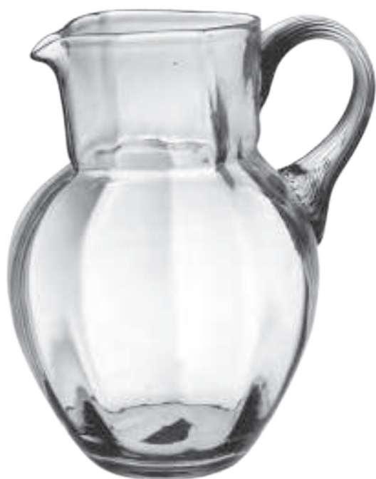
Hand blown pitcher with structure (1934 - 1960).