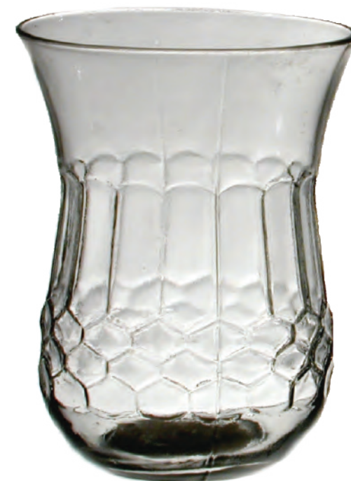
Tumbler - fixed blown (hand blown) - 1960.